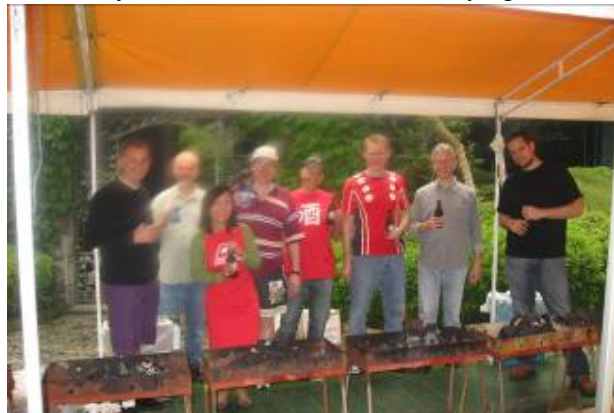
Ceremonial lighting of the charcoal: 4:30pm 19 th May, 2007. The fuzziness is caused by the heat from the BBQs, not the beer.

“As ever, the Australian Embassy served the perfect venue for the barbeque, with the lush green lawn giving a very Aussie feel (well, pre-drought Aussie feel). The Embassy and its staff again proved to be perfect hosts..”